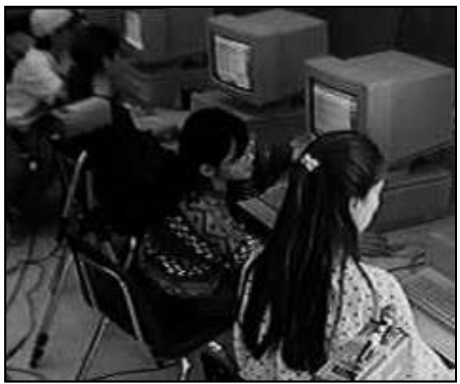
Figure 2: Physical setup of the study.

Each group met once a week for one hour after school over a period of twelve weeks. The students worked in one classroom, sitting at four adjacent Macintosh computers (see Figure 2). The computers were connected by a local area network, and all ran Aspects, allowing the sharing of documents among different machines. Seating arrangements were rotated weekly to reduce the likelihood of subgroup formation and to assign the preferred seats equally among the students. During the study they were given training in the use of Aspects, introduced to collaborative writing techniques, and given the freedom to use their new skills.